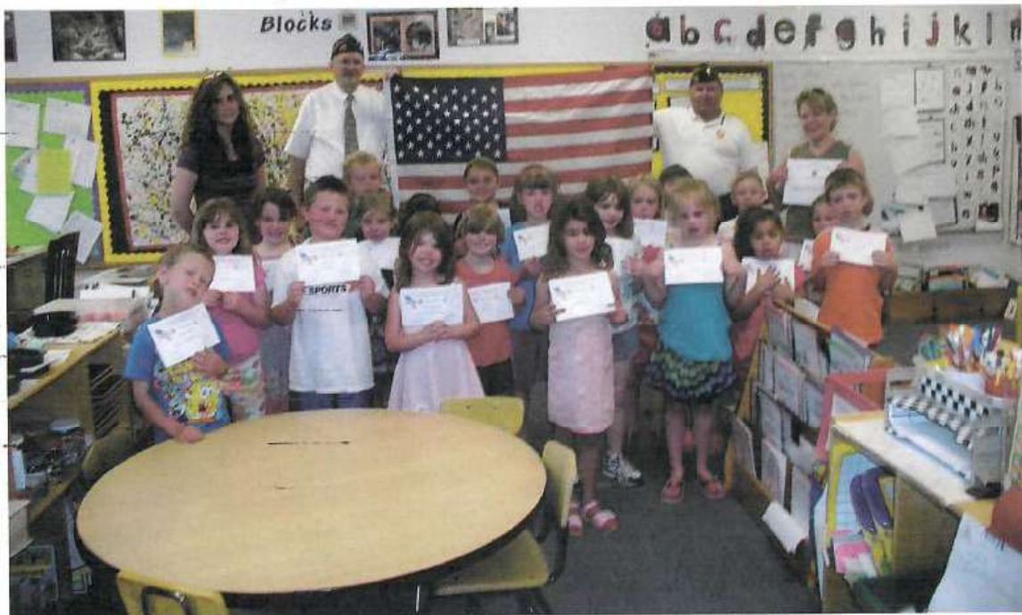
This Class is the Rollinsford Grade School, Rollinsford, New Hampshire. Students did a great job.