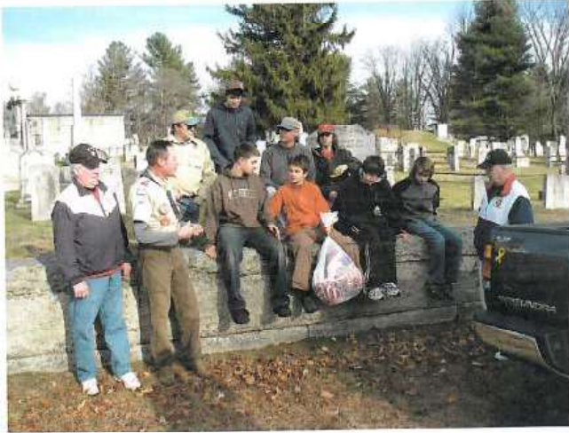
Scouts and VFW Members get photo taken, after the flags are collected through out the Cemertery

On November 23, 2009, the VFW Post 5744 South Berwick, hosted about 25 Boy Scouts from South Berwick, Troop 338 for the Scout Flag Retirement ceremonies. 200 Flags from Veterans Graves and community were burned during a Scout ceremony. After the ceremonies the VFW provided Hot Dogs and Hot Chocolate for the Hungry Scouts: