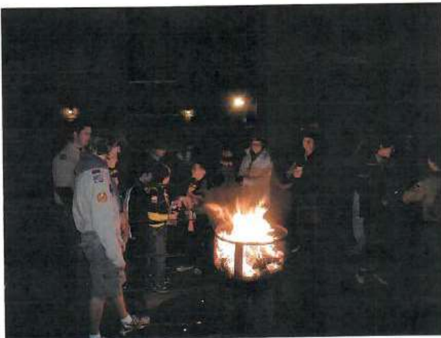
Scouts looking on, as we destroy the flags by burning,