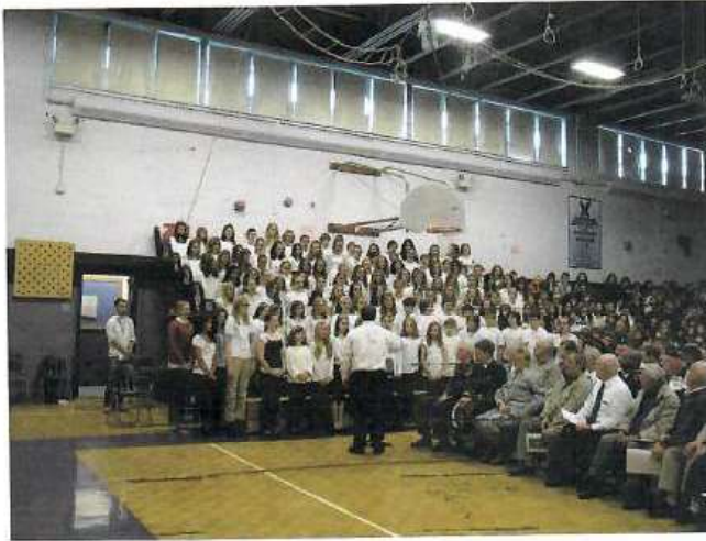
Marshwood Middle School 6 th, 7 th, and 8 th Grade Chorus' Sung Amazing Grace.