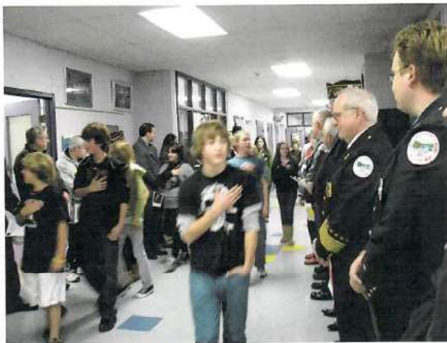
Students filed through the People to be honored, with the thank you sign. It was real touching. (Place-photo)