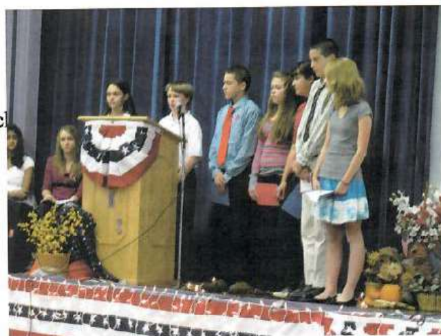
Grade 7 Purple Communities: Heroes Among Us. Each Student told what a Hero was to them. (Place-photo)