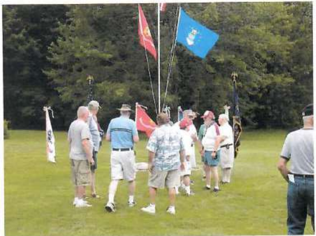
Members of the VFW Post No. 5744 getting ready for the picture in front of Flag Display.