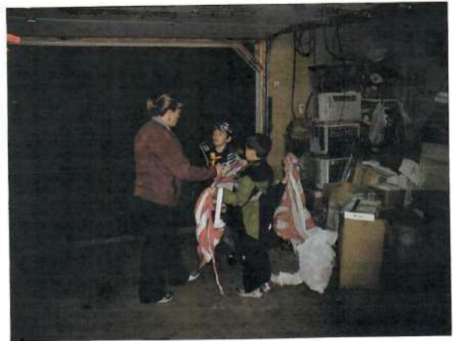
Passing out the flags for disposal, The Boy Scouts are earning badges doing this Ceremony