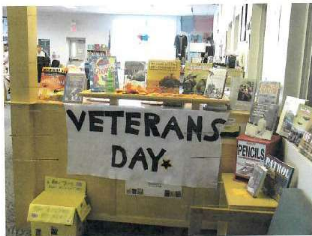
After the great program was over, the Veterans went to the library to have refreshments. (Place-photo)