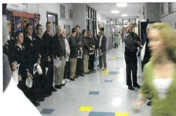
Looking down the hall in another direction. Both sides are lined with veterans (Place- photo)