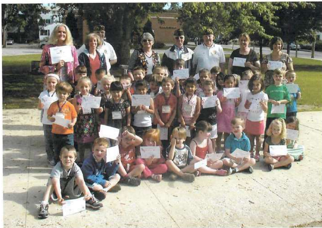
This is the Central AM class of South Berwick, Maine. The Students did a great job.