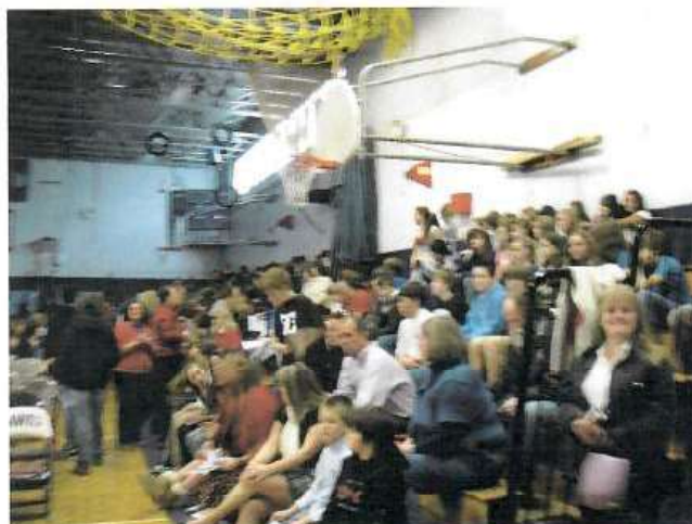
Students and Teachers filed through the visitors and then came in through the rear door, to be seated in the bleachers. (Place-photo)