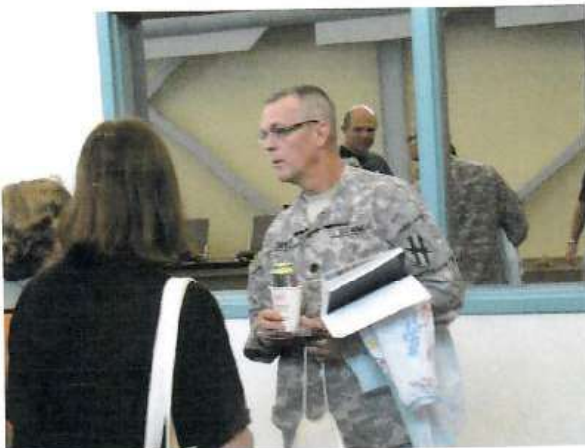
While waiting for the plane to get ready, Soldier talks with the greeters. (Place-photo)