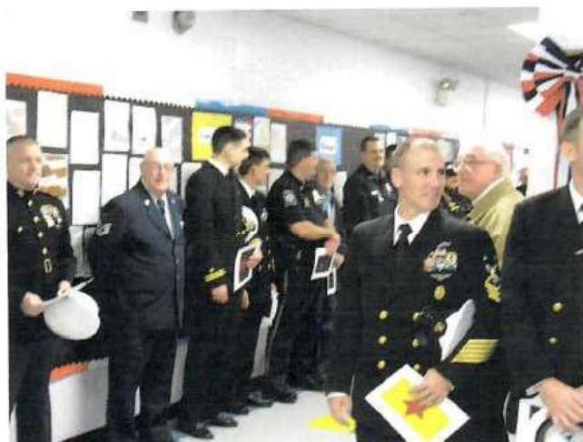
Sailors from the USS Helena Fast Attack Submarine, were present for the Celebration (Place-photo)