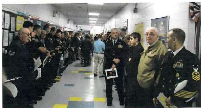
Front corridor at Marshwood Middle School, lined with Veterans, Police men, fire men, to be honored at the celebration

On November 6 th , 2009, Marshwood Middle School had their ninth Veteran's Day Celebration. The celebration highlights the dedication on those who continue to defend America's freedoms and honor those who have unselfishly served America in the past. The turn out of Veterans was great.