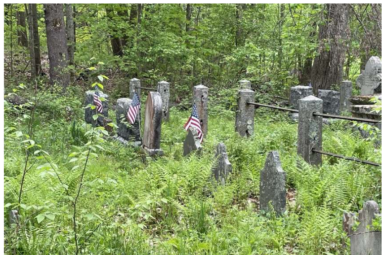
Flags at Old Fields Burying Grounds (Vine Street Cemetery)