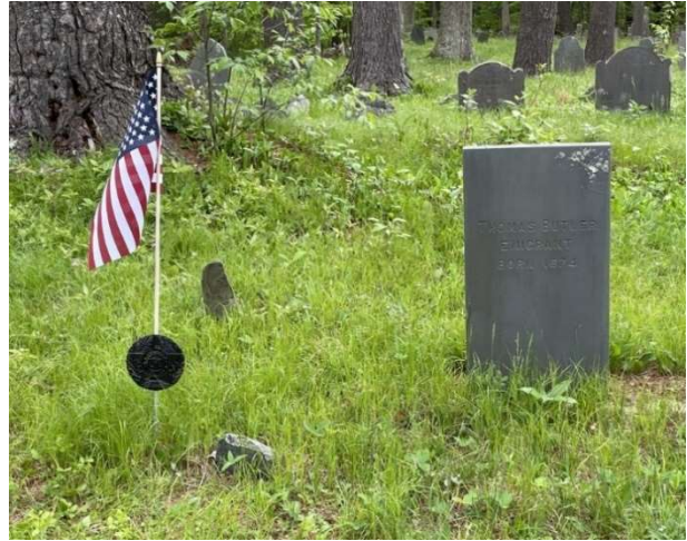
Typical flag presentation