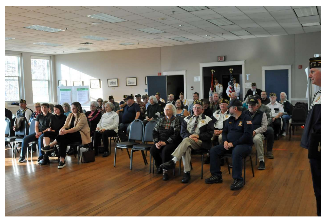
Approximately 60 were in attendance for this Veterans Day Observance