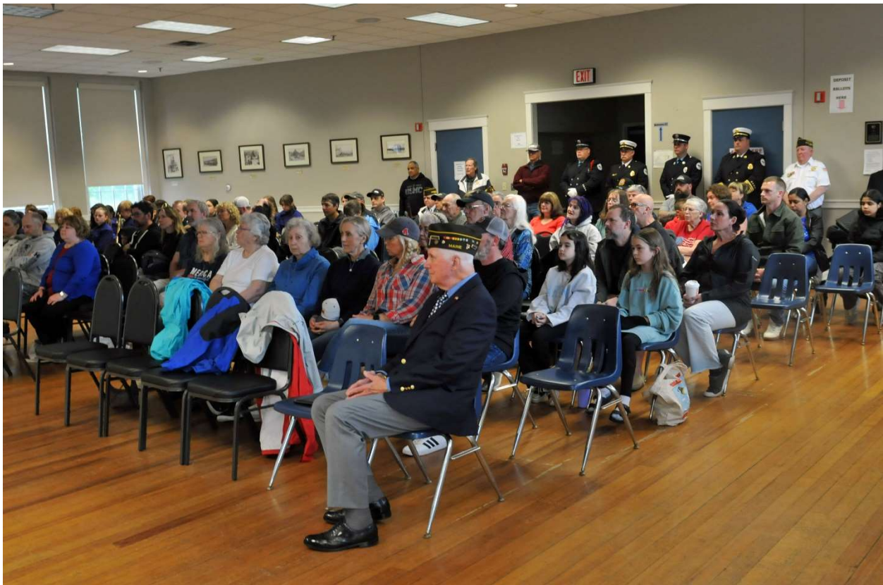
Over 100 civilians and veterans were in attendance.